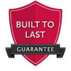
25 YEAR GUARANTEE At the core of our heating